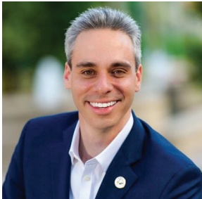
SCOTT SINGER MAYOR OF BOCA RATON