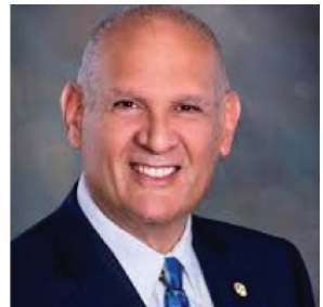
REBERT WEINROTH PBC COMMISSIONER